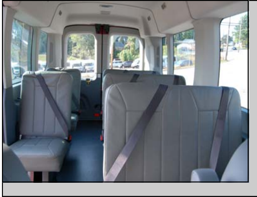
Transit Mid Roof Height