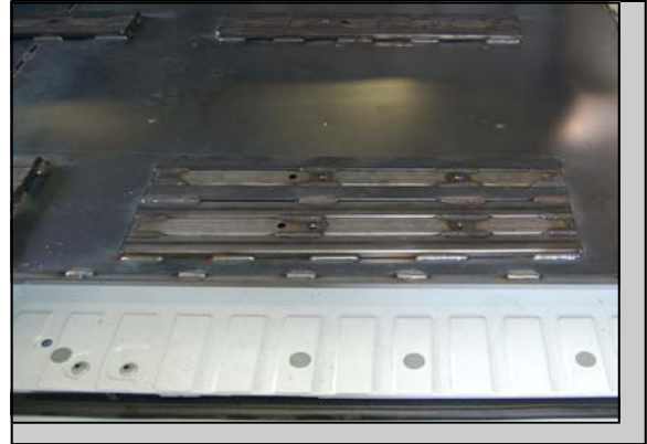
Steel Reinforced Floor with Seat Tiles