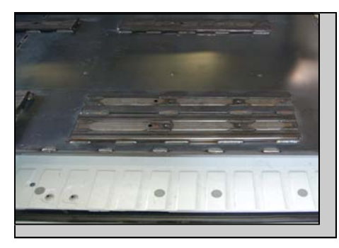
Steel Reinforced Floor with Seat Tiles

www.KeystoneCoachworks.com 4786 Library Road, Bethel Park, PA 15102 412-833-1900 Fax 412-833-1918