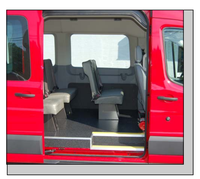
Sliding Door Entry—Mid Roof Van