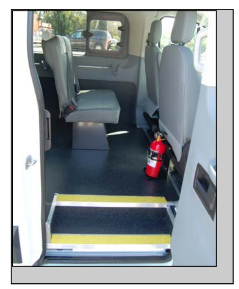
Cargo Door Entry—Low Roof Van